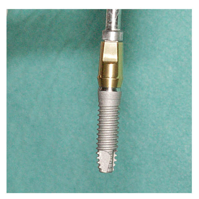
FIGURE 2. Control implant with traditional implant-abutment connection.

Linkevicius et al. Crestal Bone Stability Around Implants. J Oral Maxillofac Surg 2010.