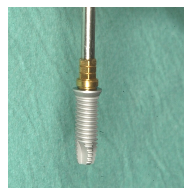
FIGURE 1. Test implant with platform switching. Linkevicius et al. Crestal Bone Stability Around Implants. J Oral Maxillofac Surg 2010.

The osteotomy site was measured to allow a minimum 3-mm distance between the 2 implants, 1-mm range from adjacent tooth/teeth, and 1-mm space between buccal and lingual/palatal crest of the alveolar ridge and implant. Implants of different diameter